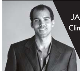
JAMES FORMAN JR. Clinical Professor of Law Yale Law School